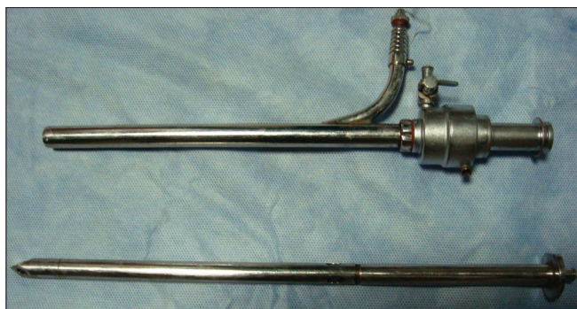
Figure 2: Palanivelu hydatid system consisting of a cannula and a trocar