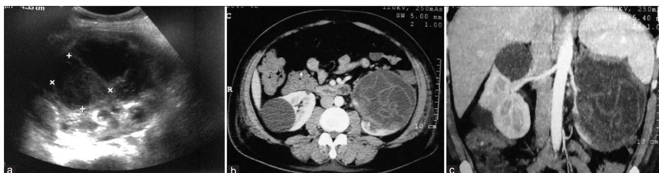
Figure 1: (a) USG showing multilocular hydatid cyst. (b and c) CECT showing left renal hydatid with multiple daughter cysts